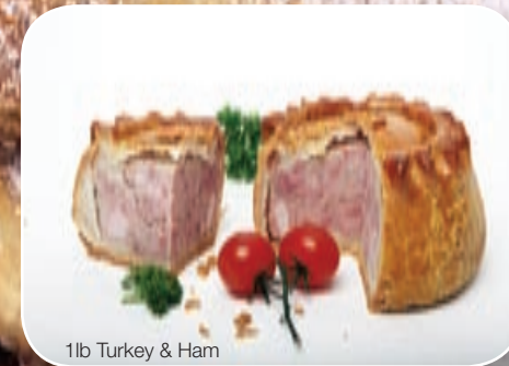
1lb Turkey & Ham