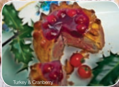
Turkey & Cranberry