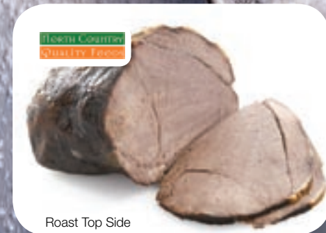
Roast Top Side