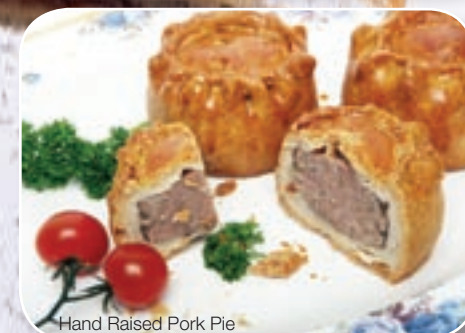
Hand Raised Pork Pie