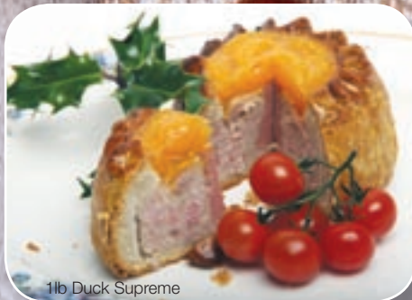
1lb Duck Supreme