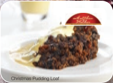
Christmas Pudding Loaf