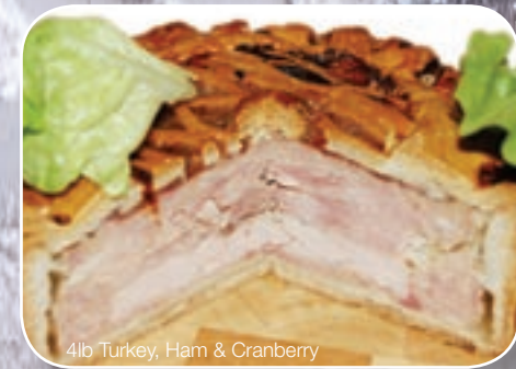
4lb Turkey, Ham & Cranberry