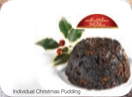
Individual Christmas Pudding