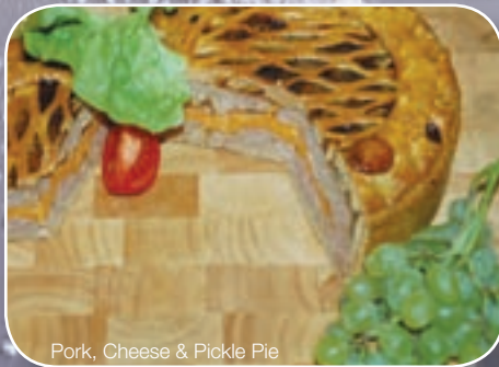
Pork, Cheese & Pickle Pie