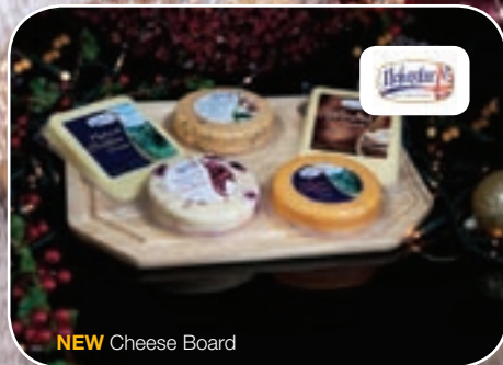
NEW Cheese Board