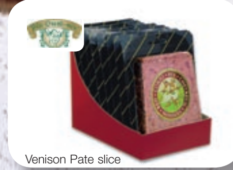
Venison Pate slice