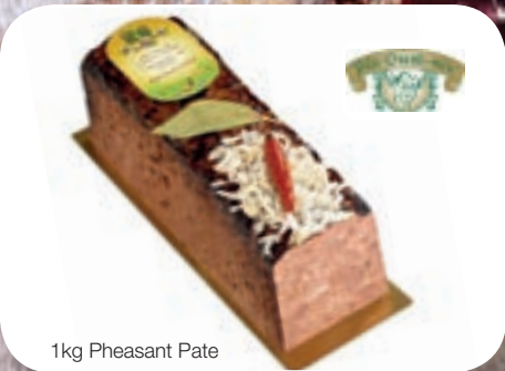
1kg Pheasant Pate