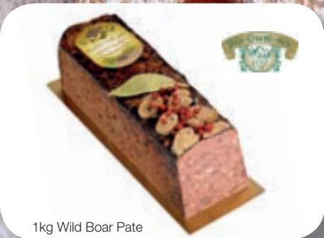
1kg Wild Boar Pate