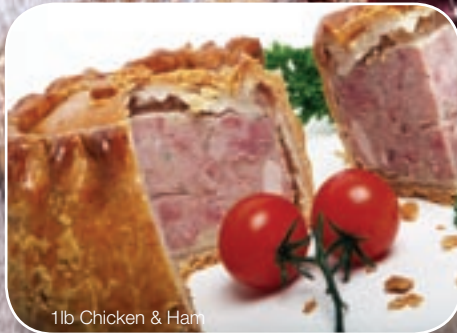
1lb Chicken & Ham