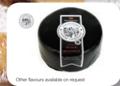
Other flavours available on request