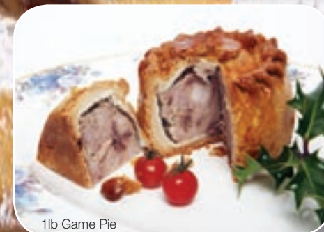
1lb Game Pie