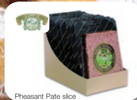
Pheasant Pate slice