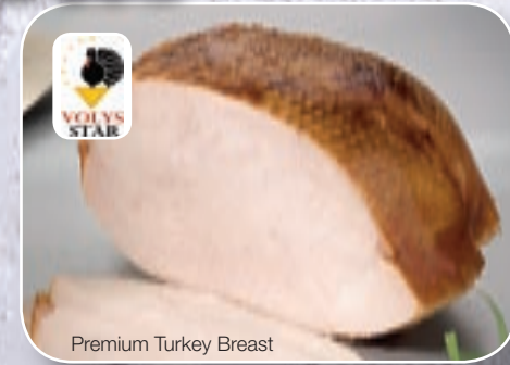
Premium Turkey Breast