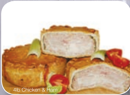
4lb Chicken & Ham