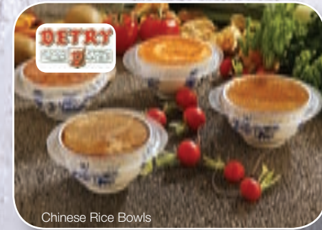
Chinese Rice Bowls