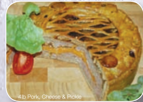
4lb Pork, Cheese & Pickle