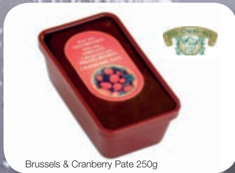
Brussels & Cranberry Pate 250g