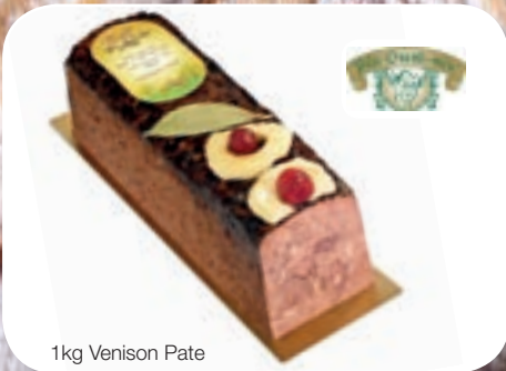
1kg Venison Pate