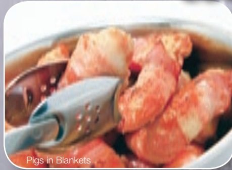
Pigs in Blankets